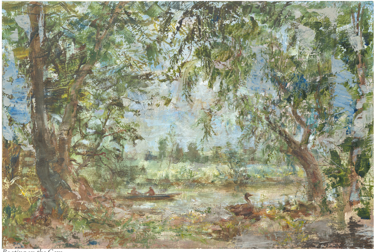
Boating on the Cam