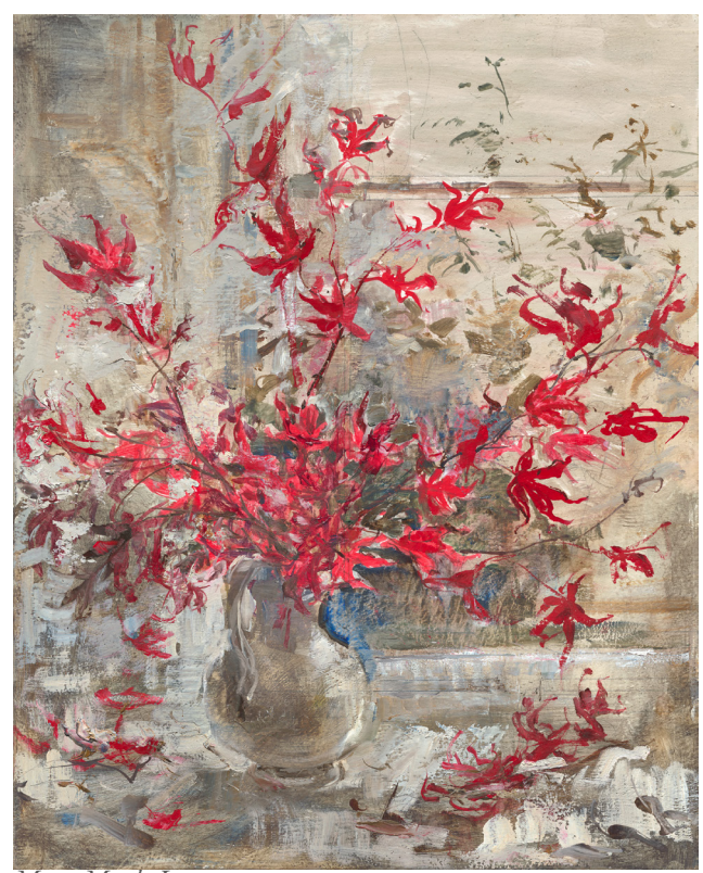
Many Maple Leaves