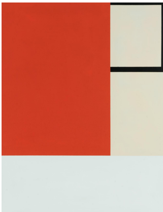
Ioannis Lassithiotakis, 'Captivity', 2020